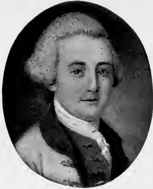
General John Cadwalader Page 32